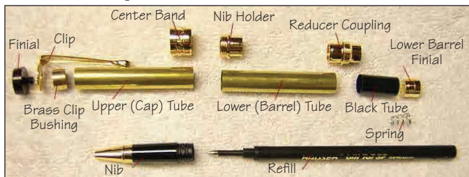
Rollerball pen parts diagram.

Requires large-diameter “B” mandrel, flat-top rollerball/fountain pen bushings (88K78.73), letter “V” drill bit, and minimum 5/8” square blank.